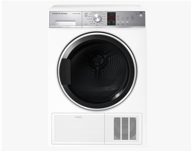
Heat Pump Dryer, 9kg