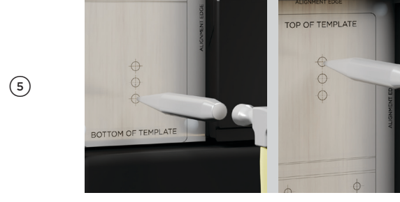
Punch one upper and one lower hole using the locations marked on the template. Note that three sets of holes are provided and not all holes need to be drilled. Drill pilot holes and remove template.