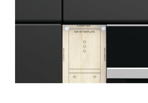
Ensure the template is completely flush against the cabinet and all four coners are secure.