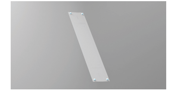
Apply adhesive putty to the back