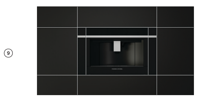
Check the alignment of both trims. If adjustments within ±1mm are required, remove the trim and