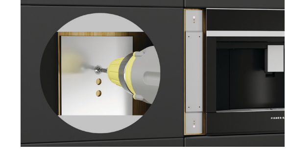
Fit the bracket into place using the supplied screws. Repeat on opposite side.