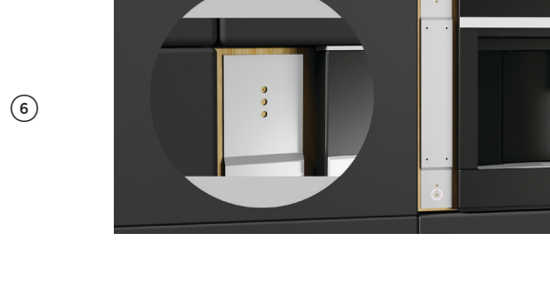
Ensure the top and bottom of the bracket sit flat against the cabinet. Align with the pilot holes.