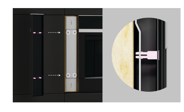
Clip the trims into place.