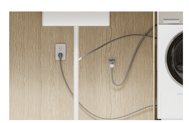
11. Connect the power cable and check product is powered on.

Route the drain hose through the guide and place into the spigot. Secure using a hose clamp.