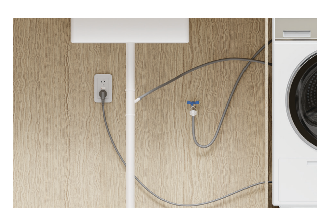
11. Connect the power cable and check product is powered on.

Route the drain hose through the guide and place into the spigot. Secure using a hose clamp.